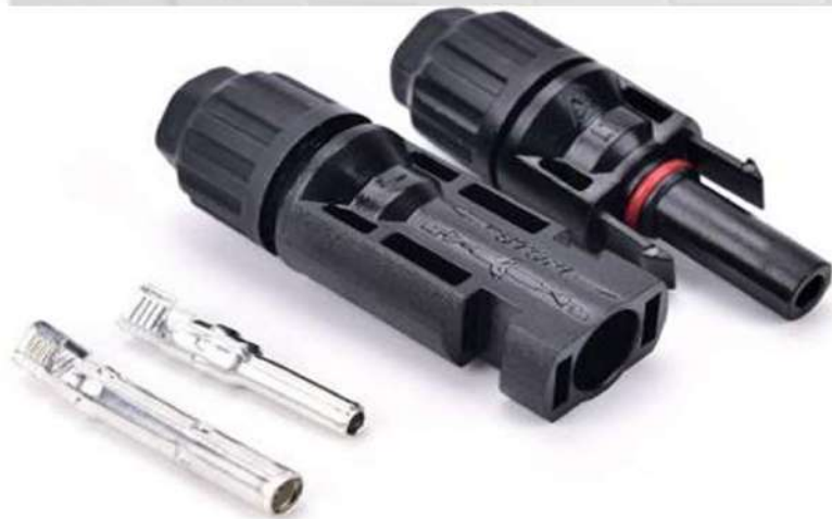
SOLAR MC4 CONNECTOR