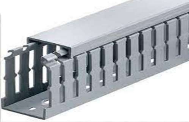
PVC WIRING DUCT