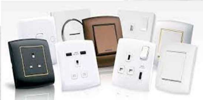
SWITCHES AND SOCKET