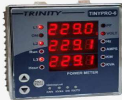
Intelligent Meters & Smart Meters