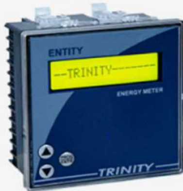
Basic Energy Meters