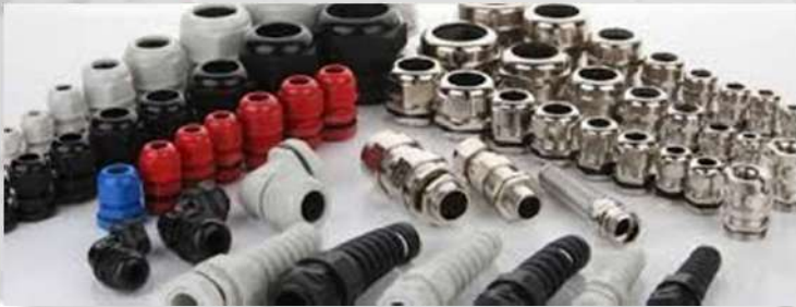
BRASS AND POLYIMIDE CABLE GLAND