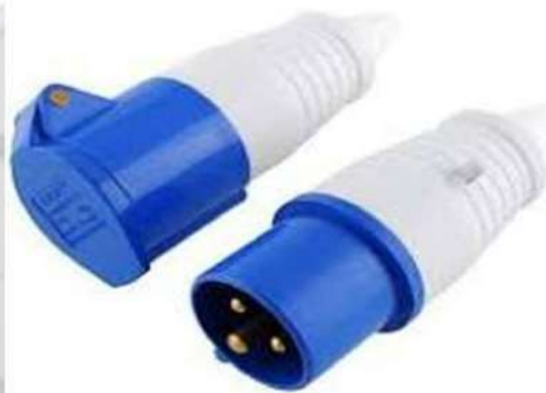
INDUSTRIAL PLUG SOCKET