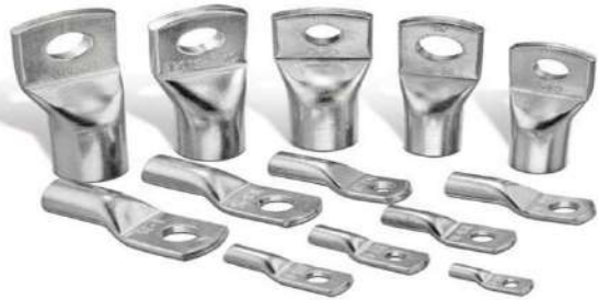
ALL RANGE OF COPPER LUGS