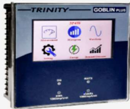
Demand Controllers & Data Loggers